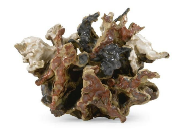
Lucio Fontana, Battaglia, 1960

But clay is not at all easy to master, and many important sculptors, like Lucio Fontana in the 1950s and many Futurists before him in the 30s, undertook the task of learning the "craft" of the ceramist, that contemptible second-cousin once removed, to create more expressive, more physically engaging sculptures. Mastering ceramics is a complex process accompanied not only by repetition and practice but by all the current technologies needed for the transformative process to take place, including kilns, tools, glazing, etc. Maybe the process-intensive investment associated with mastering ceramics is the reason that concept is sometimes secondary to form. But should that be viewed as a handicap or an advantage? A return to the formalism of Greenberg is not proposed, but neither is staying in the realm of homogeneity and idea recycling without much aesthetic preoccupation.