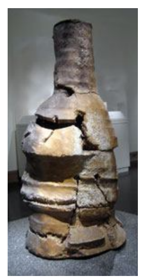
Peter Voulkos, Noodle. stoneware sculpture, 1996, Metropolitan Museum of Art

But unfortunately many sculptors using materials traditionally associated with the realm of craft, specifically clay, don't have the same advantages as Picasso. They are called potters or ceramists, not sculptors, or not even plain old artists. Even Peter Voulkos, the artworld's token ceramic sculptor, is often still referred to by art critics and historians as a potter. Why this special categorization which smells of contempt? What is it about clay that still makes the art world sceptical?