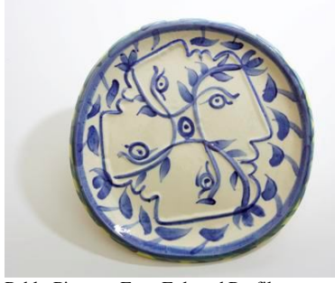
Pablo Picasso, Four Enlaced Profiles, hautes, round/square plate, 1949.

But if we try to really separate the two fields we see it's not always so simple. To differentiate between art and craft, we can quote the influential work of Rose Slivka who defines craftsman as he who "incorporates acknowledgement, however implied, of functional possibilities or commitments (including the function of decoration) – as long as he maintains personal control over the execution of the final product, and he assumes personal responsibility for its aesthetic material quality – it is craft."<sup>1</sup> Meaning that if the maker alludes in any way to function, and is in charge of both design and production, and leaves nothing to chance (artists should not be so controlling...), then we have to see the object as craft. But if one of these is not part of the equation, then we are free to call it art. So by outsourcing the production of his pots and by pointing out that through the firing process he lets chance have its way with the work, Picasso's decorative pots and plates become high art, although they look very craft-like to the contemporary viewer.